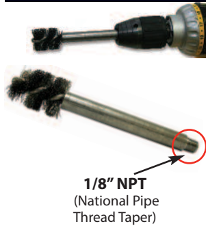
1/8" NPT (National Pipe Thread Taper)

Proper hole cleaning using a brush is essential to achieve optimum performance